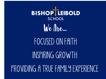
KGSL and SB