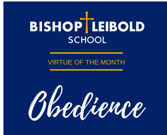
Helvetica and Playlist Script

Helvetica is the primary font to be used on Bishop Leibold marketing material. Additional fonts for headings, design, and social media usage include Playlist Script, KG Skinny Latte, and Strawberry Blossom.