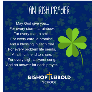
Helvetica and KGSL